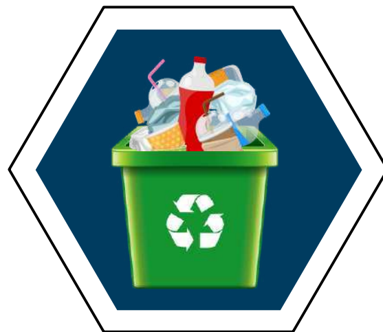
Plastic Waste Approval