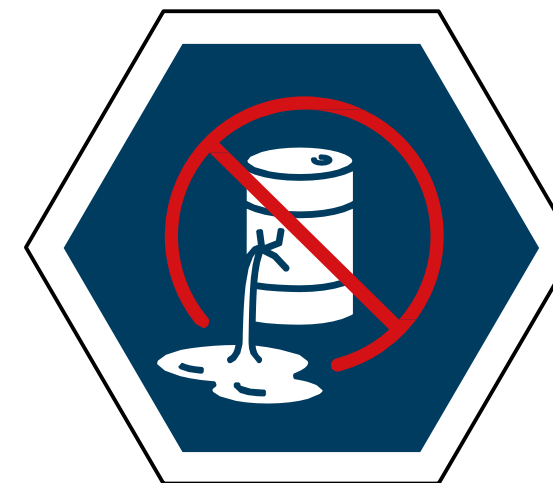
Used Oil Waste Approval