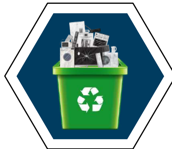
Electronic Waste Approval