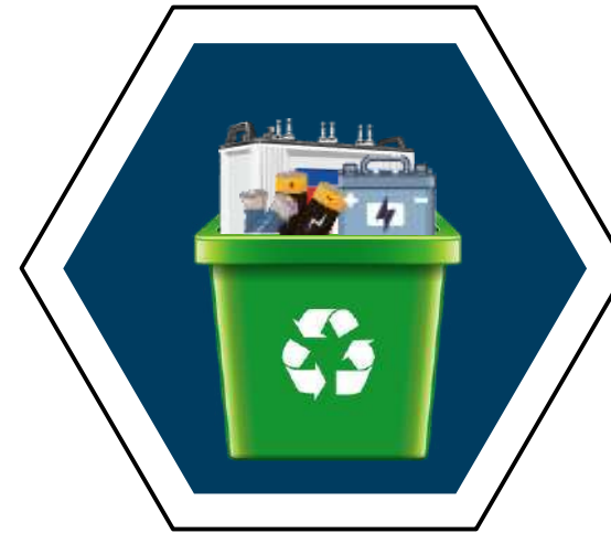
Battery Waste Approval