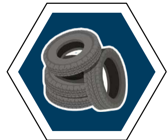
Tyre Waste Approval